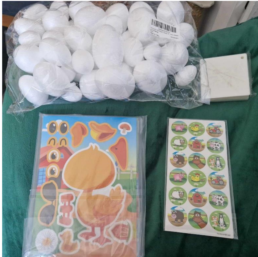
A picture of some of the crafts the children will be able to do.

N.B. ALL ALLERGIES WILL BE ACCOUNTED FOR (for example oat milk & non-latex gloves available). 'HEALTH & SAFETY' CONSIDERATIONS HAVE BEEN THOUGHT OUT IN A RISK ASSESSMENT FORM.